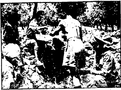
SICILY—Radiophoto—General Bernard Montgomery (center, seated on rock), who is now masterminding Eighth Army exploits in Sicily after his brilliant performance in North Africa, is shown having afternoon tea in a Sicilian orchard.