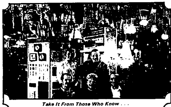
Take It From Those Who Know . . .