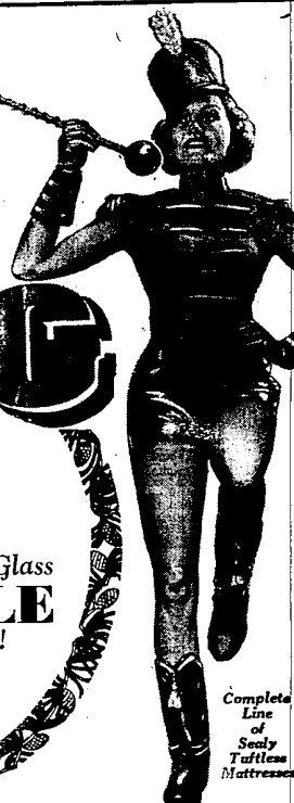
Complete Line of Sealy Tuffless Mattresses

SPECIAL GRAND OPENING GIFT! FREE! COCKTAIL TABLE OR END TABLE With Every Living Room Purchase