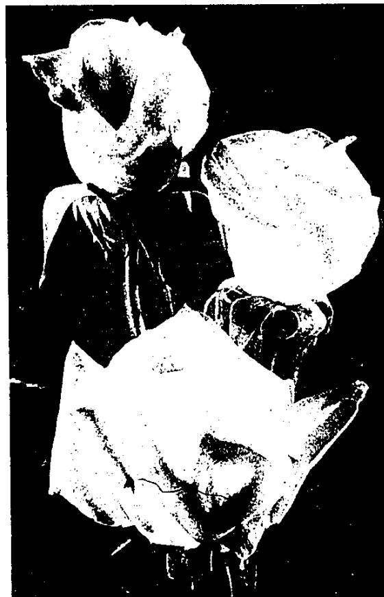
"APOLLO" takes its name from a mighty Greek god, and it was a winner in the 1972 All - America Rose Selections.