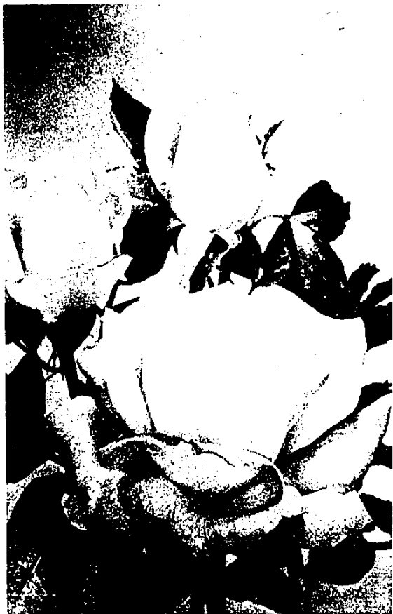
"PORTRAIT" is a hybrid tea rose that was an award winner in the All - America Rose Selections.

Imagine that! "Portrait" is a blending of rich warm pink tones and has a delightful fragrance. It is highly disease - resistant.