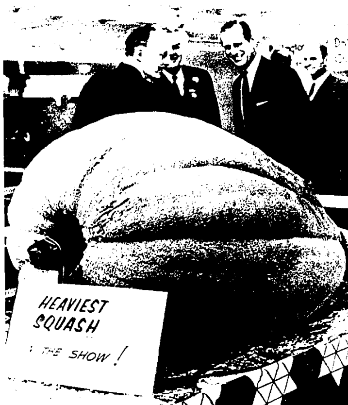
IT WEIGHS 301 1/2 lbs., it's Burpee's Right Royal squash, and it was viewed with delight at the Canadian Winter Fair in Toronto by a member of royalty -- Britain's Prince Philip.