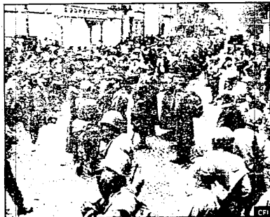
WASHINGTON, D.C.—This Signal Corps Radio-Photo shows Nazi prisoners seized in the fall of Metzarrison, awaiting removal to rear lines.