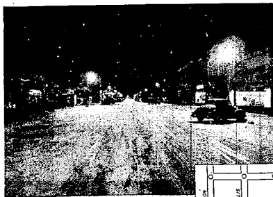
The main street at night

6000 LUMEN OVERHEAD STREET LIGHTS 2500 LUMEN OVERHEAD STREET LIGHTS 1000 LUMEN OVERHEAD STREET LIGHTS