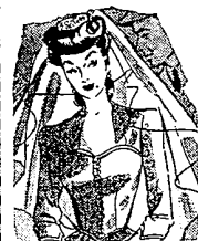
Lovely Photographs Of Your Spring Wedding