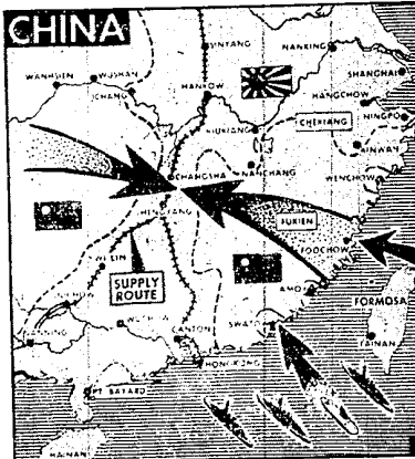
NEW YORK —Soundphoto—Allied strategy in China, according to military analysts, is designated at cutting off overseas supply routes to Japan. Following recent announcement by Gen. Brehon Somervell that our forces will eventually land on China coast, Chinese armies began to step up their attacks against enemy in anticipation of such action. When U. S. forces do effect such landings, analysts predict they will drive to meet the Chinese armies now battling eastward. Large arrows show how much such a junction would throttle complete flow of raw material and supplies moving overland to Japan.