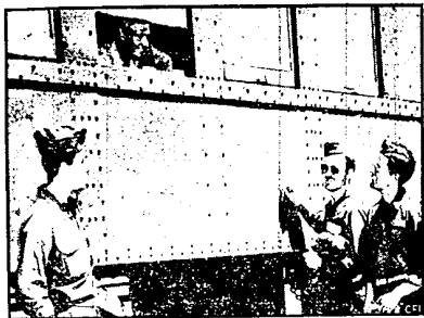
CAMP BEALE, CALIF. —Soundphoto—An unhappy 500 officers and men of the United States Army, after long service in North Africa and Europe, arrived last week in Camp Beale, California. Their feelings were expressed by this sign on a day coach in which they rode for five days from Boston to California.