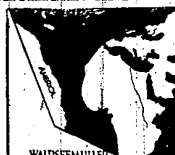
Waldseemüller map, 1507. 15 years after discovery of America, its name appeared on a New World map.