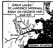
European wars—dynastic and religious—delayed more St. Lawrence exploration.