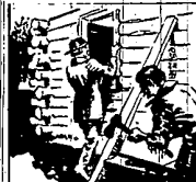
Fr. Marquette had opened Michigan's first mission at the Sault in 1668.