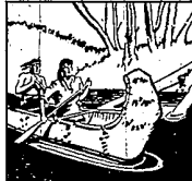
1669: Louis Jolliet, guided by a captive Iroquois, finds Detroit strait.