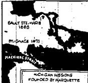
To escape hostile Sioux, the Huron and Marquette moved in 1671 to Mackinac.