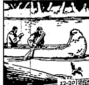
The Detroit information led Fr. Dollier and Geliné to use Jolliet's route.