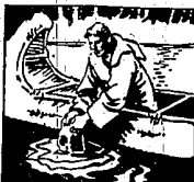
Plagued by bad luck, they broke the idol and threw it into the river.