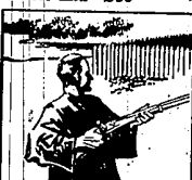
They fired a gun noosing the Jesuit fort, Sault Ste. Marie, May 25, 1670.