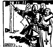
April 9, 1682 At Mississippi mouth he claimed the great valley for France.