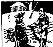
Returning, La Salle found Crevecoeur destroyed, again turned back to Miami.