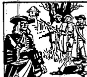
One more Kingston trip, and La Salle led his men from Ft. Miami on Dec. 21.