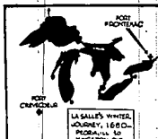
La Salle, Iron Man of New France, traveled—Peoria to Kingston—in 65 days!