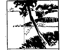
Fort St. Joseph at Niles was preceded by an earlier Fort St. Joseph, Port Huron.