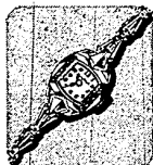
Lady's BULOVA watch in 10K rolled gold plate; 17 jewels.