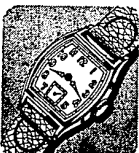
Man's gold watch, with strap. 17 jewels. Sturdily made; smartly styled.