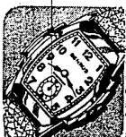
Man's BENRUS watch; yellow rolled gold plate. 21 jewels.