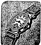
Man's Waterproof Watch; shock-proof; dust-proof. 17 jewels.