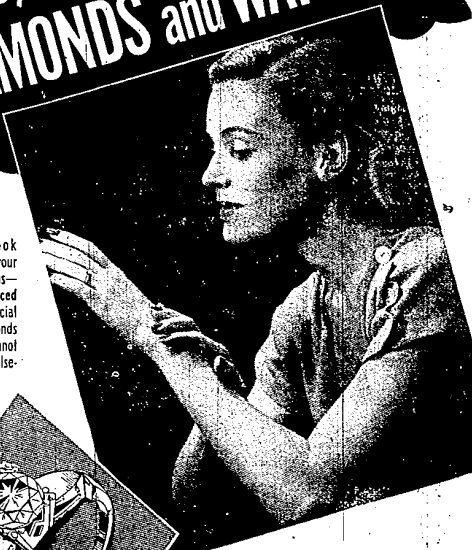
Diamond solitaire Engagement Ring of dazzling beauty. Modern mounting.

Come in—look around—make your own comparisons—you'll be convinced that these Special Values in Diamonds and Watches cannot be duplicated elsewhere!