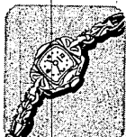
Lady's gold watch in distinctive design. 17-jewel movement.