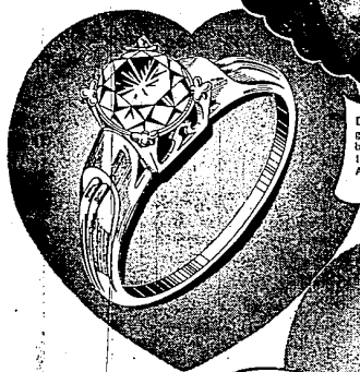
Diamond solitaire Engagement Ring in beautifully sculptured 14K gold mounting. A thrilling value! $39.50

Shortest, surest way to a lady's heart is via one of these lovely Easter Gifts. Their distinctive charm and enduring beauty are utterly irresistible!