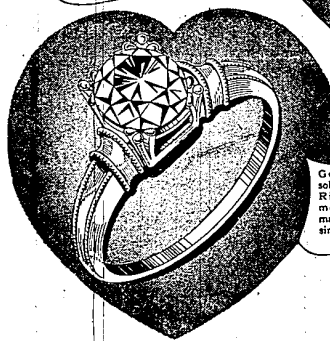
Gorgeous diamond solitaire Engagement Ring in 14K gold mounting that is a masterpiece of classic simplicity. $57.50