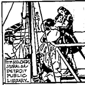
The arrival is portrayed in a mural by Melchers in Detroit Public Library.