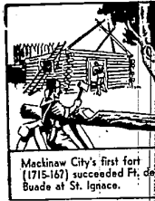
Mackinaw City's first fort (1715-16) succeeded Ft. de Buade at St. Ignace.