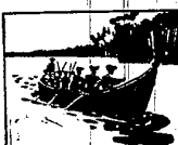
June 5, 1728: 450 Frenchmen leave Montreal; 1,200 reds join them enroute.