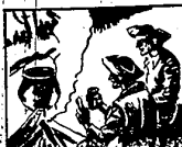
This army routed Menominee at Menominee, Aug. 24 it reached Green Bay.