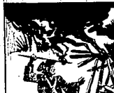
There they burned the fort and 5 Sauk town, killed a few prisoners.