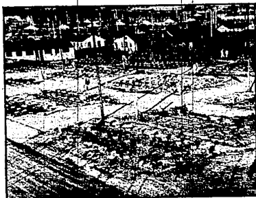
CAMP McQUADE, CALIF. — Official U.S. Signal Corps Photo — Smoke and flames from barracks fired by prisoners during a disturbance last week at Camp McQuade Disciplinary Barracks, near Watsonville, California. The prisoners, behind hastily erected barricades, used clouds, stones and timbers to prevent fire fighters and guards from entering this section of the compound. Resistance was finally quelled using tear gas, but without resort to firearms or serious injury. By that time, however, a total of thirty-six buildings were completely demolished.

for Dependents: Family allowance for dependents is a measure for the duration plus six months, except that such an allowance will continue throughout any period of enlistment contracted prior to July 1, 1946.