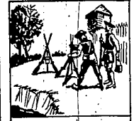
Nov. 29, 1765: The French flag is lowered, colors are stacked, and Britain's rule is proclaimed.