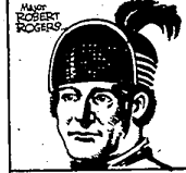
Nov. 28, 1765: Major Rogers' famed Rangers encamp on Grosse Ile.