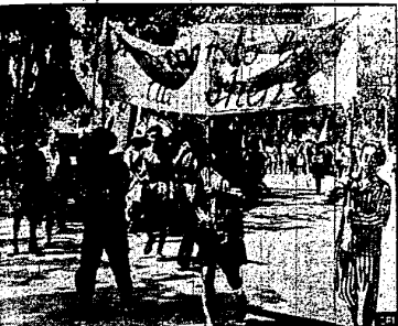
CAROLOS CAMP, CYPRUS — — Availing themselves of the second press visit to the British-bull Carolos Camp, Jewish illegal immigrants held a demonstration to articulate their problem to the world. Here three deportees who had been held at infamous Dachau prison in Germany, wear their Dachau uniforms. Their motto, literally translated means "From prison camp to prison camp — 'til when?" Latest developments in Palestine was the Arab demand for the dissolution of the Jewish Agency and extremist groups with a threat that the Arabs might take action in defense of their "lives and property."