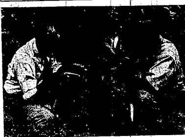
Marginal "firing" of corn leaves shows soil's lush supply is too low to nourish the growing plant.