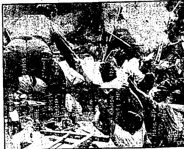
WASHINGTON, D. C. (HARRISONBURG, VA.) SOUNDPHOTO — Ten women were killed and about 50 other persons were injured when an explosion in a beauty shop wrecked a building there last week. Photo shows one of the victims as she was removed from the wreckage.