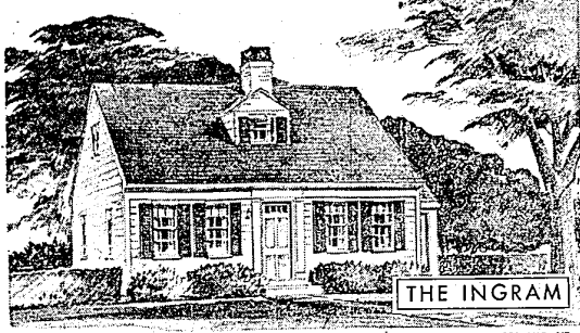
HOUSING PLAN SERVICE, Inc. 226 AUG. 47