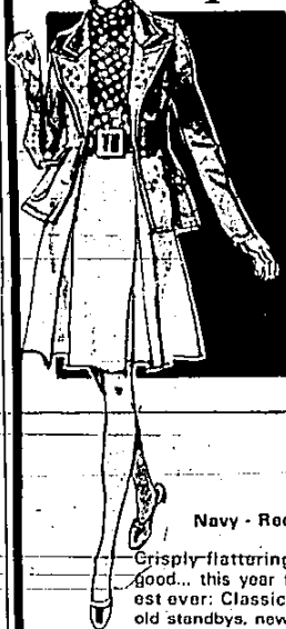
Navy - Red - White

Crisply flattering, always good... this year the great- est ever: Classic combos, old standbys, new favorites in coats, dresses, suits, a welcome renaissance of a ladylike look.