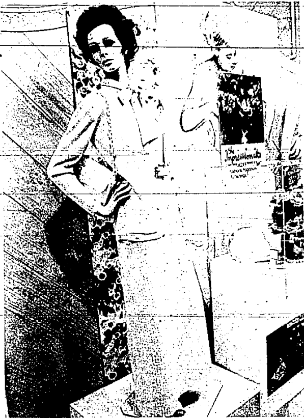
SOFT AND PINK and 100% polyester is this long dress which depicts the "cardigan-look". Pink and white checked shirt is topped by a pale pink bodice and matching pink sweater. Easy to wear and to care for, this outfit is by Parade and sells for $58.