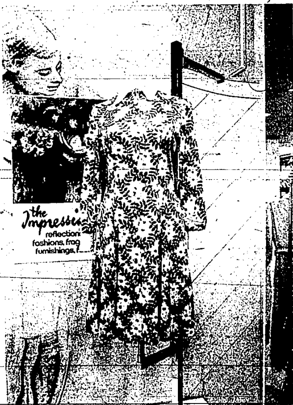
The Impressive reflection fashions, frog furnishings.