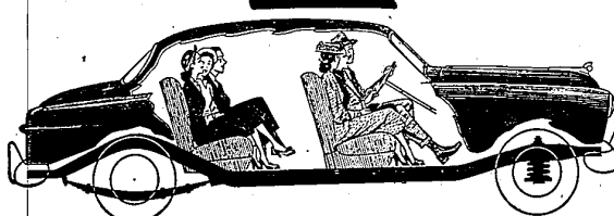
Cutaway view shows the "Mid Ship" Ride and brand-new springs that let the wheels stop over bumps!

Your Ford Dealer invites you to ride to the Ford Auto Show, Sunday Evenings—RBC Network. Listen to the Ford Theater, Friday Evenings—CBS Network. See your newspaper for time and station.