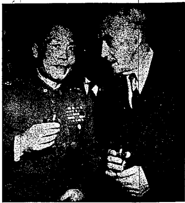
NANKING, CHINA — — General Li Tsung-Jen (left) is shown chatting with U. S. Ambassador Leighton Stuart. It is reported that General Li seeks peace with Communists.