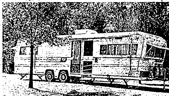
"HOLIDAY RAMBLER" -- a fun way to spend a vacation on the open road.

Tel-Twelve Mall is located in Southfield at Telegraph and Twelve Mile Roads. The show will remain open through March 18th from 10 AM to 9 PM daily and from noon to 5 PM on Sundays.