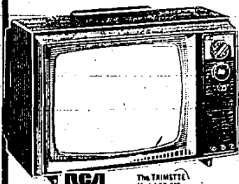
The TRIMETTE Model ER-130 14" diagonal picture