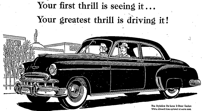
The Stylized De Luxe 2-Door Sedan White sidewall tires optional at extra cost.