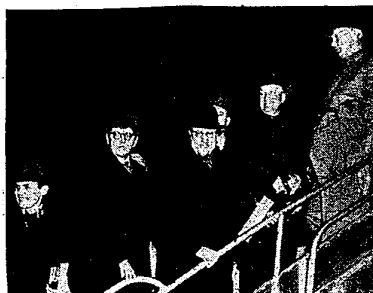
NEW YORK — Dmitri Shostakovich (second from left) and other members of the Russian delegation to the Cultural and Scientific Conference for World Peace, board an American airliner, bound for Stockholm enroute to Russia. Other members of the delegation include, left to right: Alexander Oparin; Shostakovich; Sergei Gerasimov; Alexander Fadeyev; Mikhail Chlaureli; Ivan Rozhanski and Peter Pavlenko.

Strap on your roller skates and get down to the Hard Times Dance at the high school gym, Saturday night, April 23, from nine till twelve.