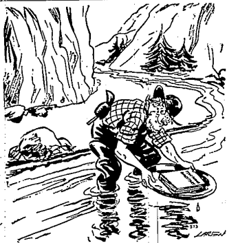
"That's gold in them that phone book Yeller Pages."