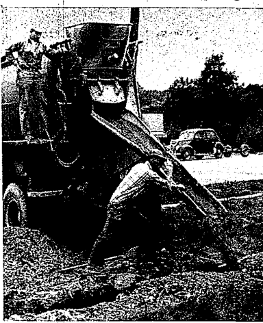
Workmen put cement for the foundation of Lili's new infant Wear Store, on Grand River avenue across from the old store. The new building was necessitated by the Christmas stock present. Business has outgrown the old location.