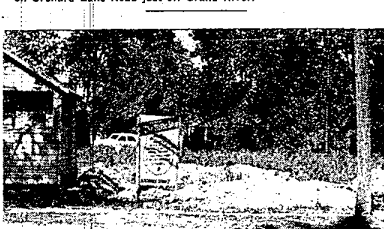
Excavation through hard clay for foundation walls is no snap. Don Haviland, owner of the building going up on Grand River at Nine Mile, says the building will house a radio and television sales and service, now located on Nine Mile near the Cut-Off.