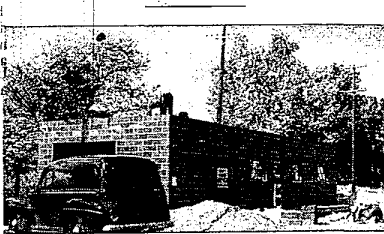
Workmen put the finishing touches on the roof of the Green Speedy Auto-Wash, due to be ready for business soon. The building will house a nine-minute auto washing service. It is located on Orchard Lake Road just off Grand River.