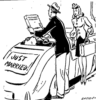
"I'm taking the telephone directory with us on our honeymoon. These Yellow Pages may come in handy."

Yes, your hair can be lovelier than ever — with a flattering new hair-do attuned to the fashion of the day and the coming season!