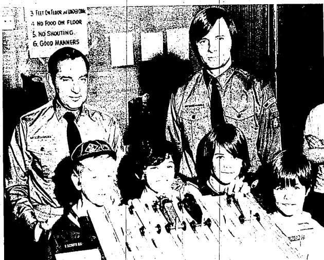
THE CUB SCOUTS "Indy," the pinewood derby, tests the wood carving skills of Farmington cub scouts, who compete by rolling their handmade cars along an inclined track. Five packs competed recently at Orchard Methodist