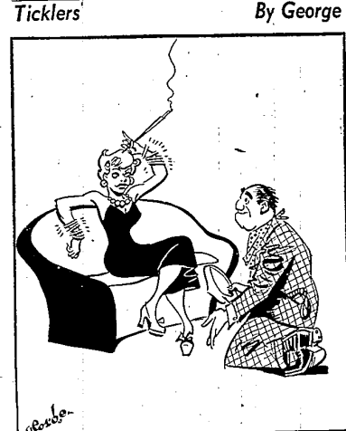
"Sorry, Spike, it just wouldn't work. . . . We live in two different underworlds."