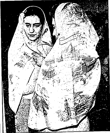
FOR VISITORS TO ROME —This Italian girl models one of the religious souvenir scarfs which will be available in Rome, Italy, during the Holy Year of 1950. Hundreds of thousands of Catholics from all over the world are expected to make a pilgrimage to Rome.