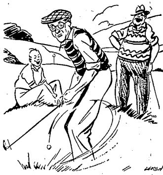
"You won't get trapped when you consult the Yellow Pages of the telephone directory to find where to buy it."