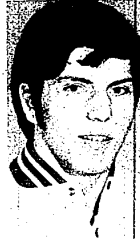
John Glenn