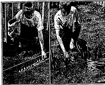
Soil Largest Onion Sets Deeply to Produce Green Onions. Three Weeks After You Plant Them the Harvest Can Begin

First harvest which an amateur gardener can reap from spring sowing is a mess of green onions, and how good they taste! Three weeks after onion sets are planted you can pull up green onions and serve them with the dinner salad.