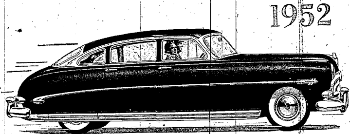
1952 HUDSON HORNET Four-Door Sedan in Hudson-Aire Hardtop Styling

LADIES' DISH NIGHT — WEDNESDAY and THURSDAY — ALWAYS PLENTY OF CONVENIENT PARKING SPACE —