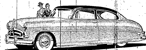
THE SPECTACULAR HUDSON WASP Only new car of its year!

Here are 1952's only new models... A fabulous 1952 Hudson Hornet... with new Hudson-Aire Hardtop Styling at standard sedan and coupe prices. There's a new, lower-priced running mate to this fabulous car—the spec- tacular Hudson Wasp, with thrilling action in its powerful H-127 engine! And there's a new Commodore Eight for '52...with Hudson-Aire Hardtop Styling with utmost luxury. All new Hudsons are available with Hydra- matic Drive. The brilliant Commodore Six and the thrifty Pacemaker complete Hudson's line-up of great values. Better see them right away! Standard trim and other specifications and accessories subject to change without notice.