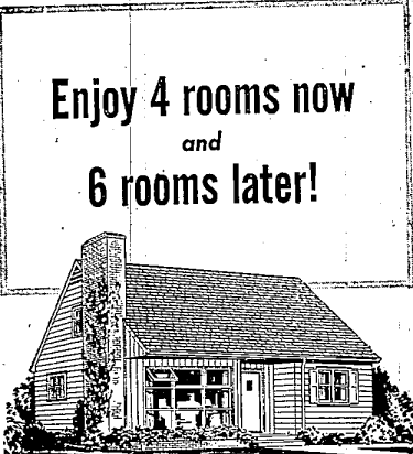
Design No. 6208

With planting time approaching, Michigan corn growers have a new aid in solving their problem of selecting the best hybrid corn for their fields. It's a new extension folder, F-67, which gives results of hybrid corn trials that are conducted annually at several locations in Michigan to provide impartial performance records and to determine what hybrids do best under different conditions. Hybrids offered for sale each year in Michigan differ in their maturity, yielding ability, lodging resistance and other characteristics.