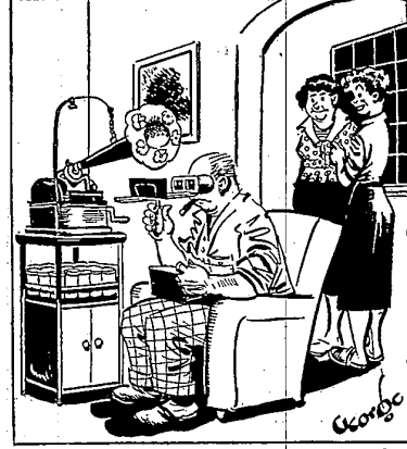
"First he decided to wait for radio, then he waited for television, now he's waiting for colored TV."