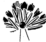
Farmington Shop League

The fresh started out the season with two victories over Bentley and Clarencville and ended