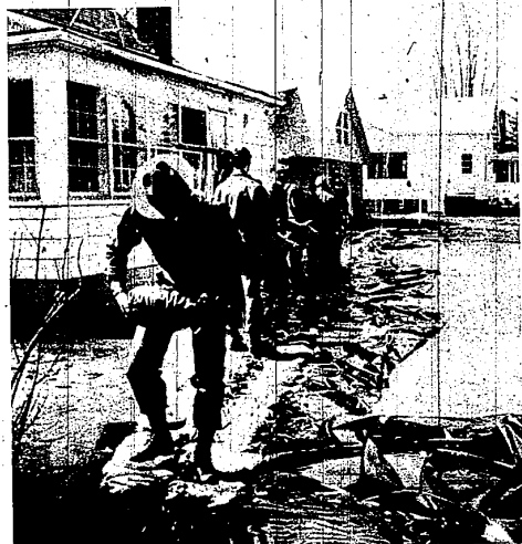
MORE THAN 80 Army Reservists headquartered at Livonia and Fraser volunteered a Saturday's work in sandbag operations at New Baltimore, on Lake St. Clair.