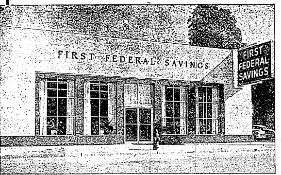
Redford Branch—Grand River at McNichols