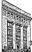
Downtown Headquarters Griswold at Lafayette