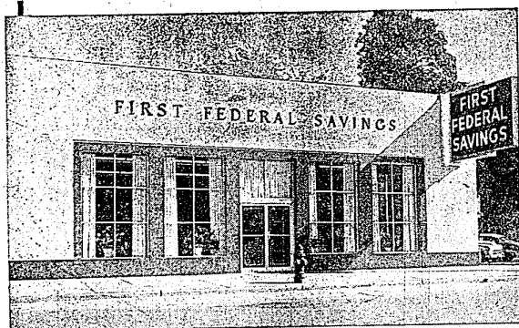
Redford Branch—Grand River at McNichols