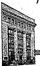
Downtown Headquarters Griswold at Lafayette

FIRST FEDERAL SAVINGS Redford Branch—Grand River at McNichols