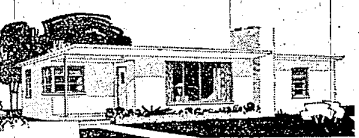
A SMALL HOUSE PLANNING BUREAU DESIGN NO. A-269